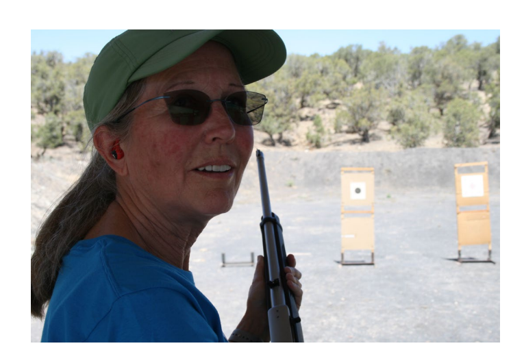
Thanks to the NRA FOUNDATION and the FOUR CORNERS RIFLE AND PISTOL CLUB for their support and GRANT FUNDS!