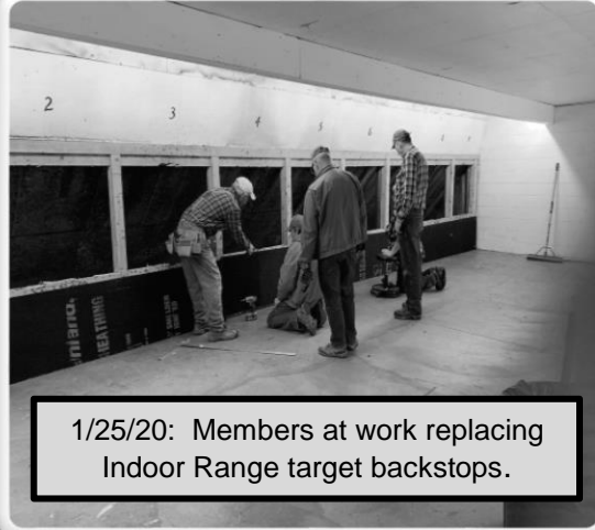
1/25/20: Members at work replacing Indoor Range target backstops.