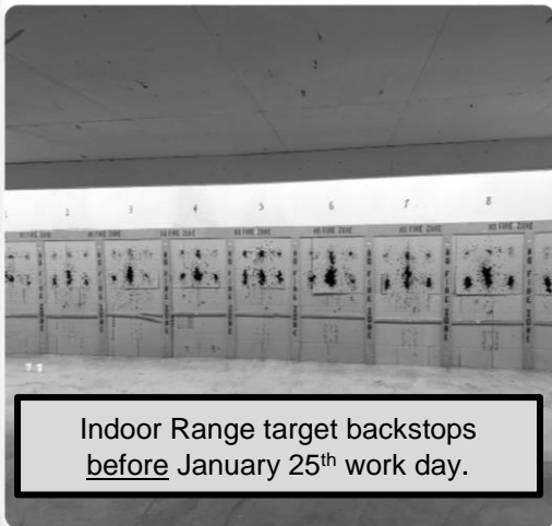
Indoor Range target backstops before January 25 th work day.