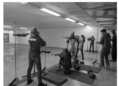
4CRP requires eye and ear protection at the Indoor and Outdoor Range